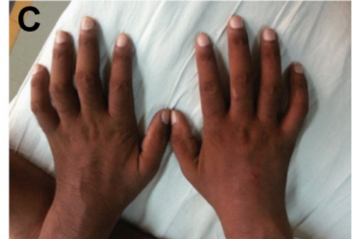
[Table/Fig-1a-c]: A 28-year-old male patient of POEMS syndrome showing (a) hyperpigmented cuatneous patch over chest (in midline and right paramidline location) (b) oedema over lower limb and (c) clubbing